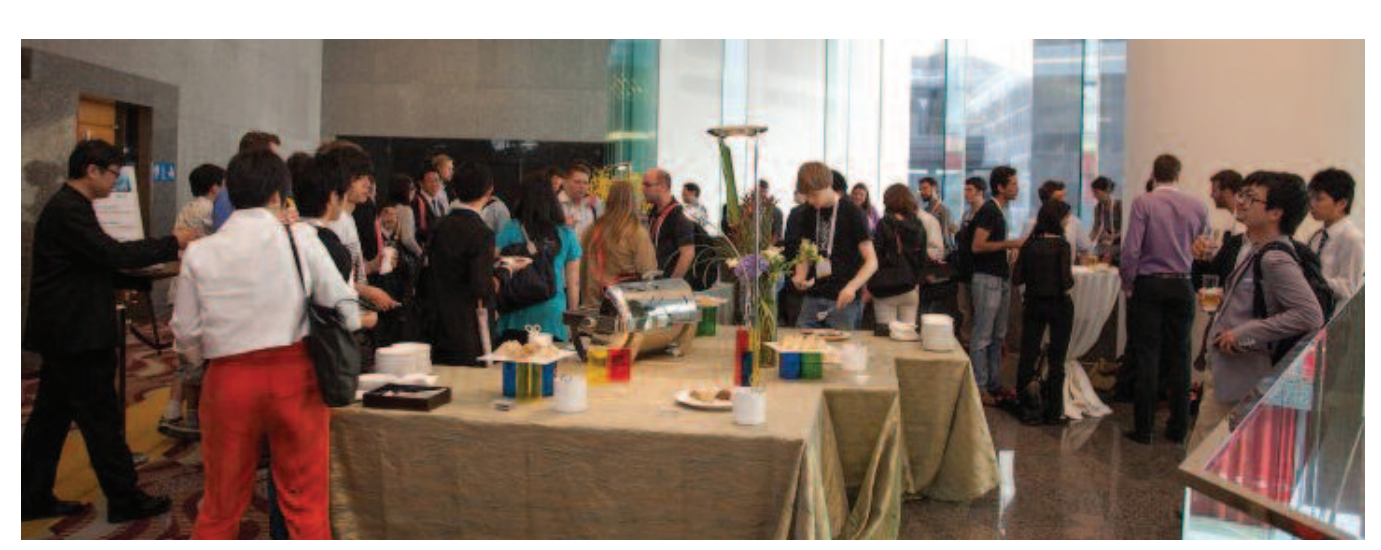
Student reception at Acoustics 2012 Hong Kong